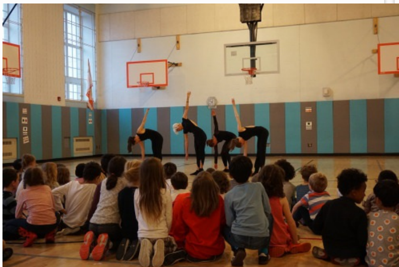
Dance Performance by Marie-Christine Giordano Dance in the gymnasium at PS 133 William A. Butler School in Brooklyn

In the context of the French language initiative «Adopt a School», the Consulate General of Switzerland launched its partnership with PS 133 William A. Butler School in Brooklyn last Friday with a modern dance performance by Marie-Christine Giordano Dance .