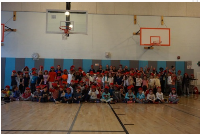
Kids with Swiss baseball caps after the performance

Originally developed by the The International Organisation of La Francophonie (OIF) and French Education in New York (EFNY) in 2015, the initiative «Adopt a School» invites representations of French-speaking countries to «adopt» a New York City public school that has a French-English dual language program or another strong French language component. The idea to introduce this program at PS 133 came from parents of Swiss pupils. This eventually led to the Swiss Consulate General's engagement within the context of «Adopt a School» as a sponsor of PS 133.